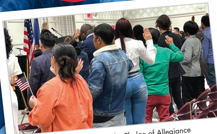
New citizens recite the Pledge of Allegiance to the United States of America.