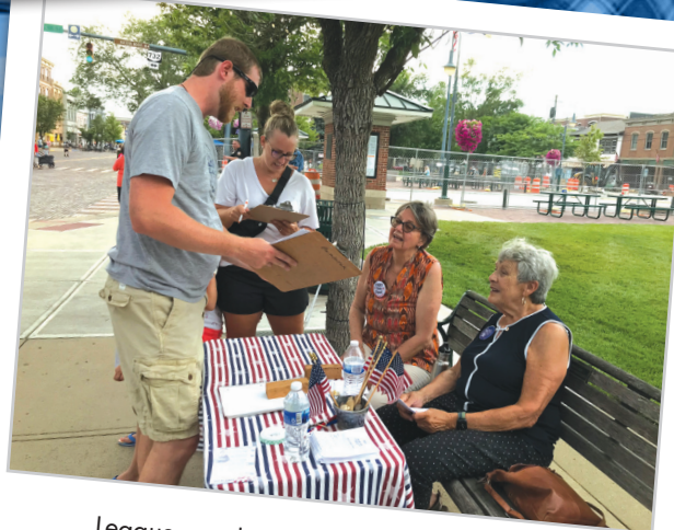
League members register citizens to vote.