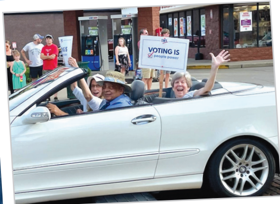
Promoting the importance of voting at the Oxford Freedom Fest parade.

Visit Vote411.org to view your personalized ballot