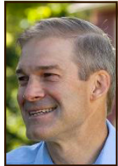
Jim Jordan Party: Republican

Although no policy or law can change hearts and minds of those committed to supporting racism, we have a requirement implement anti-discrimination laws and policy that punish racism in all aspects from health care to financial lending to police reform. There must be actionable punishments for embedding racism in society. We also need to develop anti-racism education programs in schools and all other aspects of broaden our understanding of the American experience.