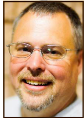
Steve Perkins Party: Libertarian

America must strive to be a country where all citizens, created equally in God's image, have the freedom and opportunity to pursue their dreams under a system of limited government where individuals are protected by equal opportunity and equal justice under the law. Much of my work in Congress is in pursuit of these ideals: personal freedom, economic opportunity, limited government, equal opportunity, and equal justice. These principles will help secure social and racial justice.