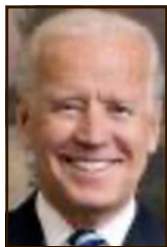
Joseph R. Biden, Jr. Party: Democrat

Campaign Website http://www.joebiden.com Campaign Email info@joebiden.com Campaign Facebook http://www.facebook.com/joebiden Campaign Twitter @joebiden Campaign Instagram http://www.instagram.com/joebiden/ Campaign YouTube http://www.youtube.com/channel/UCWNpXitY8eJ-ku6M-v25MKw Mailing Address Biden for President PO Box 58174 Philadelphia, Pennsylvania 19102