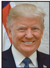
Donald J. Trump Party: Republican

Campaign Website http://www.donaldjtrump.com/ Campaign Email info@donaldtrump.com Campaign Facebook http://www.facebook.com/DonaldTrump? Campaign Twitter @realDonaldTrump Campaign Instagram http://www.instagram.com/teamtrump/ Campaign YouTube http://www.youtube.com/channel/UCaQ12DyGU2un1Ei2nMYsqQA