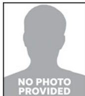
HOWIE HAWKINS (Green) (Candidate did not respond to questions by publication date.)

It's a false choice to think we have to choose between our public health and economy; they're linked. On Day One, I'll implement the COVID strategy I've laid out since March – surging testing and protective gear; distributing vaccines safely and free of politics; helping schools and small businesses cover costs; and getting state and local governments resources to keep educators, cops, and firefighters on the job. I'll respect science and tell the truth, period. And I'll build our economy back better, creating millions of good-paying jobs. I'll revitalize manufacturing, build a clean energy economy, and boost caregiving – easing the squeeze on working families, providing paid leave, and getting caregivers the respect and pay they deserve.