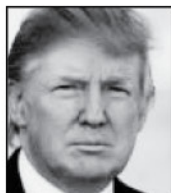
DONALD J. TRUMP (Republican) (Candidate did not respond to questions by publication date.)