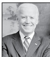
JOE BIDEN (Democrat) Former Vice President of the United States

NOTE: US League of Women Voters contacted these 4 Presidential candidates on September 4, 2020. One candidate responded to questions by the Marion Star publication date. Please visit VOTE411.org for additional responses as they come in.