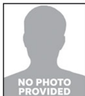
JO JORGENSEN (Libertarian) (Candidate did not respond to questions by publication date.)